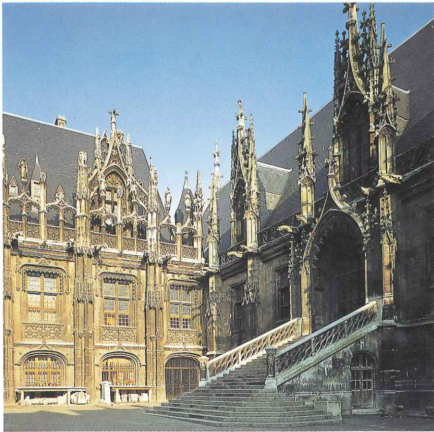
174 Courtyard of the Palace of Justice (formerly Treasury), Rouen, 1482 The Flamboyant Gothic style

This name was invented to convey the character of later fourteenth- and fifteenth-century buildings in England because in their decorations straight lines are more frequent than the curves and arches of earlier 'decorated' tracery. The most famous example of this style is the wonderful chapel of King's College in Cambridge, figure 175 , which was begun in 1446. The shape of this church is much more simple than those of earlier Gothic interiors – there are no side-aisles, and therefore no pillars and no steep arches. The whole makes the impression of a lofty hall rather than of a medieval church. But while the general structure is thus sober and perhaps more worldly than that of the great cathedrals, the imagination of the Gothic craftsmen is given free rein in the details, particularly in the form of the vault ('fan-vault'), with its fantastic lacework of curves and lines recalling the miracles of Celtic and Northumbrian manuscripts, page 161, figure 103 .