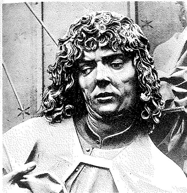
183 Veit Stoss Head of an apostle Detail of figure 182