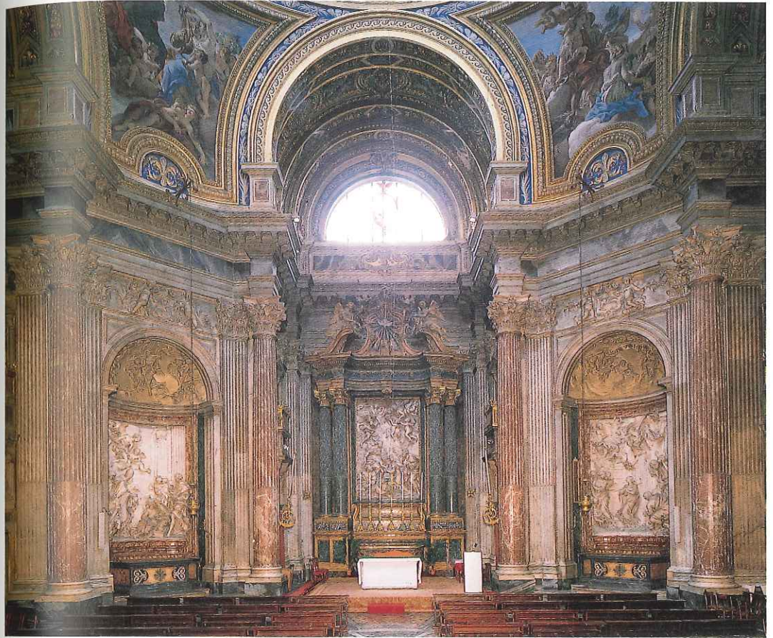
283 Francesco Borromini & Carlo Rainaldi Interior of the church of Sta Agnese, Piazza Navona, Rome, c. 1653

which had influenced the course of art so often in the past, also had an indirect effect on the development of Baroque. The Catholic world had discovered that art could serve religion in ways that went beyond the simple task assigned to it in the early Middle Ages – the task of teaching the Doctrine to people who could not read, page 95 . It could help to persuade and convert those who had, perhaps, read too much. Architects, painters and sculptors were called upon to transform churches into grand show-pieces whose splendour and vision nearly swept you off your feet. It is not so much the details that matter in these interiors as the general effect of the whole. We cannot hope to understand them, or to judge them correctly, unless we visualize them as the framework for the splendid ritual of the Roman Church, unless we have seen them during High Mass, when the candles are alight on the altar, when the smell of incense fills the nave, and when the sound of the organ and the choir transports us into a different world.