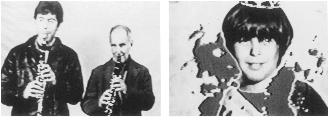
Fig. 5. TVDO, Caipira In (Local Groove) , stills from video, 1987. The group TVDO has been responsible for radical experiments in terms of formal invention and renewal of the expressive qualities of video. Caipira In , for example, fragments images of Brazilian identity into a disconnected mosaic. A spirit of corrosive parody and cynical humor pervades the work. Since this video does not explain or clarify issues of national identity, it radicalizes the experience of dispersion and doubt. Ostensibly a record of a popular religious festival, Caipira In becomes a reflection on the deforming presence of the videomakers and the distance between their culture and that of their subject.

monitor—so as to produce an instantaneous image of the performer, like Narcissus looking at himself in the mirror.