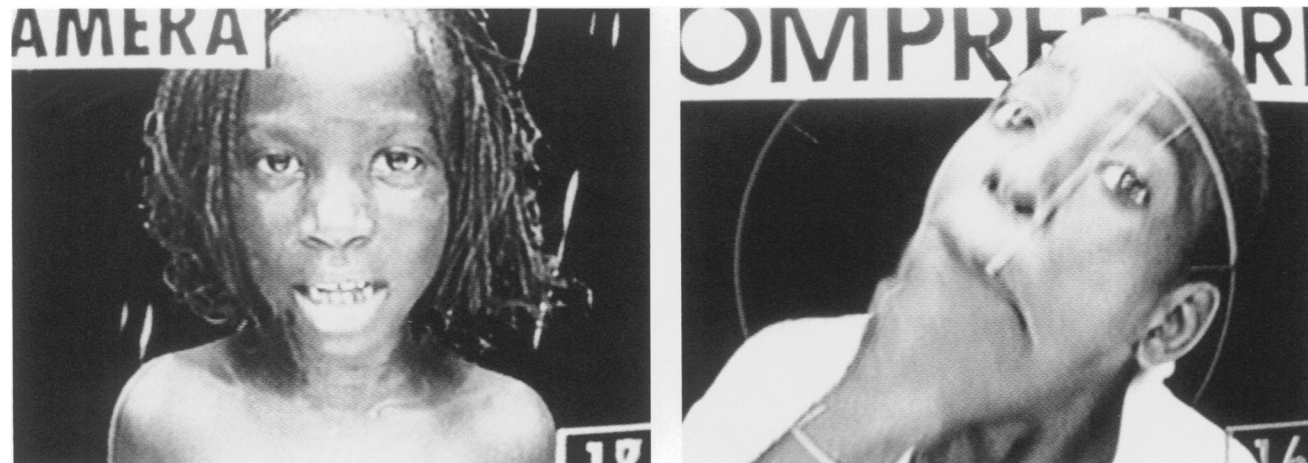
Fig. 7. Sandra Kogut, Parabolic People , stills from video, 1991. The raw material used to make Parabolic People included videotaped improvisations by pedestrians in cabins erected on the streets of several cities around the world (Paris, New York, Tokyo, Moscow, Rio de Janeiro, Dakar, etc.). The shots from different sources were mixed and added to computer lettering and graphics.

The work of Kogut is something rather different again. This artist seems to concentrate and express decisively innovative tendencies in video art; yet at the same time she radicalizes the process initiated by Nam June Paik of electrification of the image and disintegration of any sort of unity or discursive homogeneity. The technique of multiple writing that is the stamp of this work—where text, voices, sounds, and simultaneous images combine and strive to form a canvas of rare complexity—constitutes in itself the structural evidence of what may be called the aesthetic of saturation, of excess (a maximum concentration of information