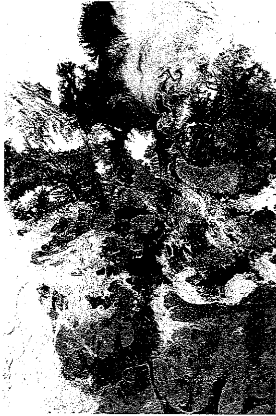
2.4. Icon for the Capitalocene: Sea Ice Clearing from the Northwest Passage, Data 2012.

and stinging jellyfish. Neither did technological determinism produce the Third Carbon Age. Coal and the steam engine did not determine the story, and besides the dates are all wrong, not because one has to go back to the last ice age, but because one has to at least include the great market and commodity reworldings of the long sixteenth and seventeenth centuries of the current era, even if we think (wrongly) that we can remain Euro-centered in thinking about “globalizing” transformations shaping the Capitalocene. 51 One must surely tell of the networks of sugar, precious metals, plantations, indigenous genocides, and slavery, with their labor innovations and relocations and recompositions of critics and things sweeping up both human and nonhuman workers of all kinds. The infectious industrial revolution of England mattered hugely, but it is only one player in planet-transforming, historically situated, new enough, worlding relations. The relocation of peoples, plants, and animals; the leveling of vast forests; and the violent mining of metals preceded the steam engine; but that is not a warrant for wringing one’s hands about the perfidy of the Anthropos, or of Species Man, or of Man the Hunter.