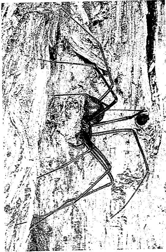
2.1. Pimaa cthulhu .

The tentacular are not disembodied figures; they are cruidarians, spiders, fingery beings like humans and raccoons, squid, jellyfish, neural extraganzas, fibrous entities, flagellated beings, myofibril braids, matted and felted microbial and fungal tangles, probing creepers, swelling roots, reaching and climbing tendrilled ones. The tentacular are also nets and networks, IT critters, in and out of clouds. Tentacularity is about life lived along lines—and such a wealth of lines—not at points, not in spheres. “The inhabitants of the world, creatures of all kinds, human and non-human, are wayfarers”; generations are like “a series of interlaced trails.” 8 String figures all.