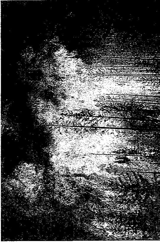
2.3. Icon for the Anthropocene: Flaming Forests. From Rocky Mountain House, Alberta, Canada, June 2, 2009.