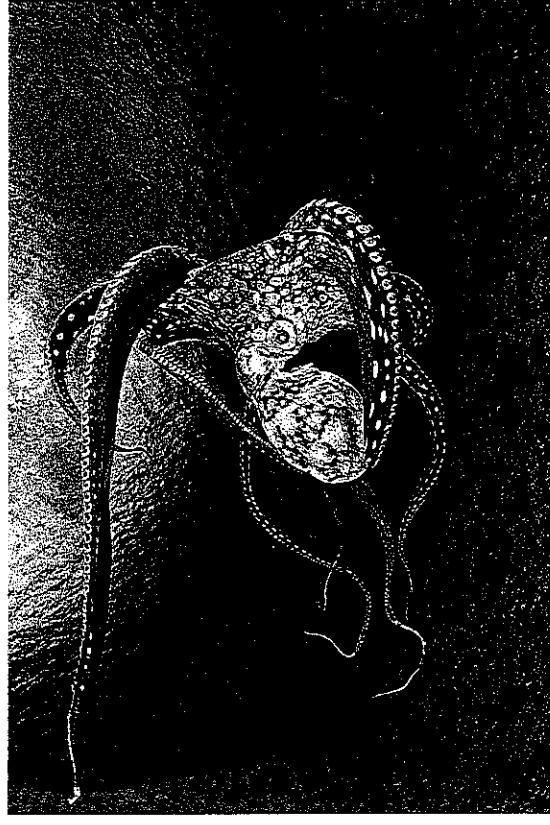
2.7. Day octopus, Octopus cyanea , in the water near Lanai, Hawaii.

But coral and lichen symbionts also bring us richly into the storied tissues of the thickly present Chthulucene, where it remains possible—just barely—to play a much better SF game, in nonarrogant collaboration with all those in the muddle. We are all lichens; so we can be scraped off the rocks by the Furies, who still erupt to avenge crimes against the earth. Alternatively, we can join in the metabolic transformations between and among rocks and critters for living and dying well. “Do you realize,’ the phytolinguist will say to the aesthetic critic, ‘that [once upon a time] they couldn’t even read Eggplant?’ And they will smile at our