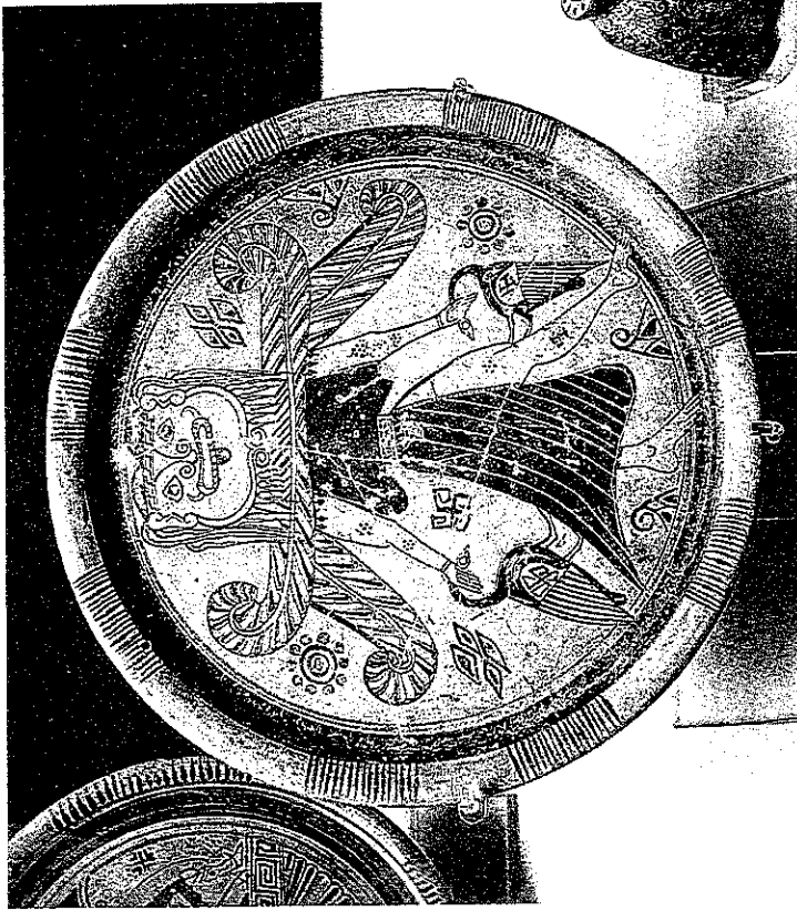
2.6. Icon for the Chthulucene. Potnia Theron with a Gorgon Face. Type of Potnia Theron, Kameiros, Rhodes, circa 600 BCE, terracotta, 13 in. diameter, British Museum, excavated by Auguste Salzmann and Sir Alfred Blotiti; purchased 1860.

In many incarnations around the world, the winged bee goddesses are very old, and they are much needed now. 63 Potnia Theron/Melissa's snaky locks and Gorgon face tangle her with a diverse kinship of chthonic earthly forces that travel richly in space and time. The Greek word Gorgon translates as dreadful, but perhaps that is an astralized, patriarchal hear-